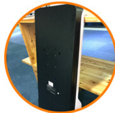
Back View Metal Housing