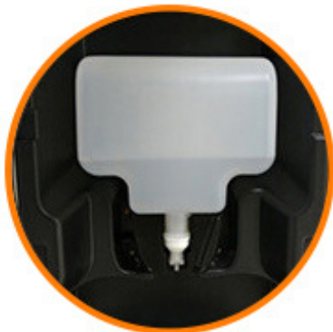
Internal Auto Dispenser